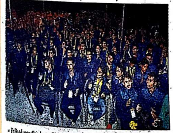
· Iribal youthis from Ch suarh, Jharkh nd, get acqui at mair visit to