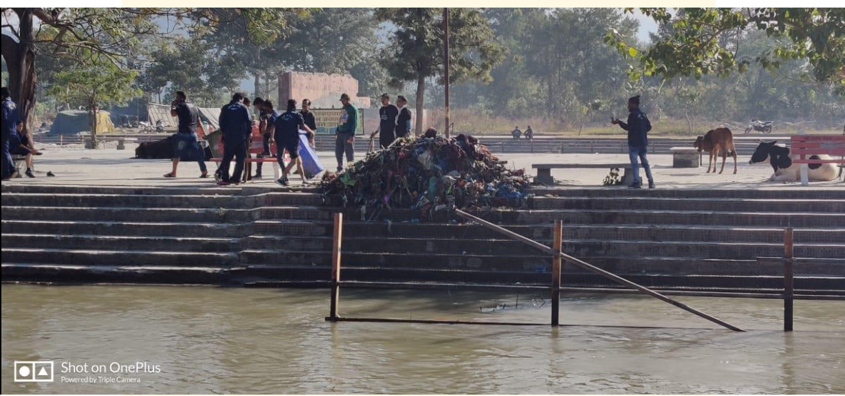
Cleanliness Drive in Haridwar, Uttarakhand