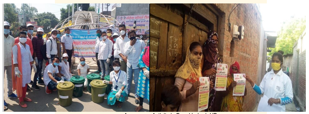
Awareness Activity in Farrukhabad, UP

• 7635 awareness activities around the River Ganga at Ganga Ghats, rallies, Door to Door personal contact activity, Wall Writing/Slogan Writing, Distribution of IEC material activity, Social Media awareness like messages, posters etc. and Online Quiz and Signature campaigns on Ganga Swachhta in which 1,26,696 youth participated.