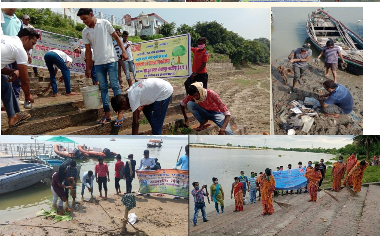
Cleanliness Drive in Prayagraj, UP