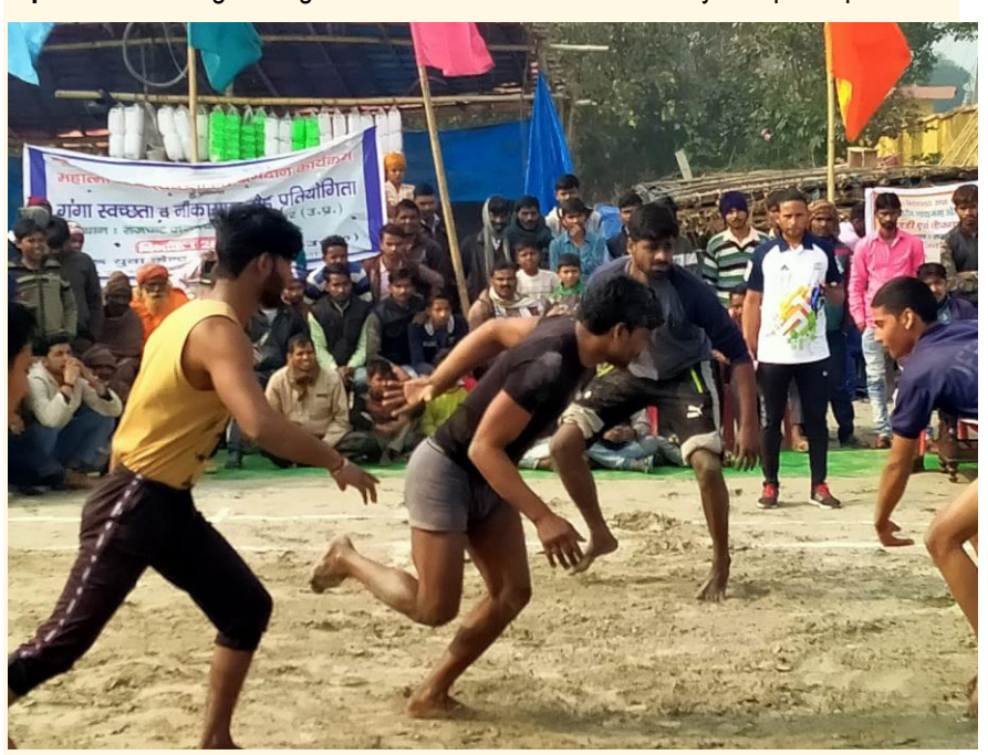
Sports Tournament in Kannuj, Uttar Pradesh

462 Sports competition in Ganga Village were conducted in which 7938 youth participated.